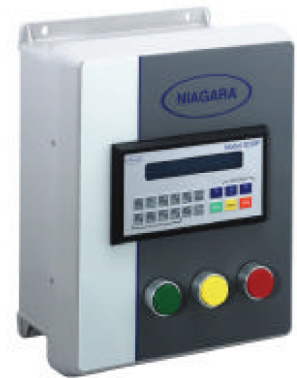
Model 3030FW Batch Controller Indicator/Totalizer