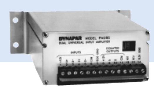
PM28S replaces PM21, PM25 and 101UA

Dual universal input amplifier . . . provides 6 types of input functions